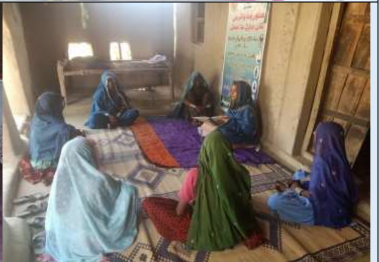
COVID-19 Awareness sessions at Mirpurkhas