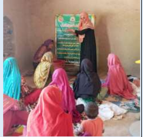
COVID-19 Awareness Sessions with communities in District Khairpur