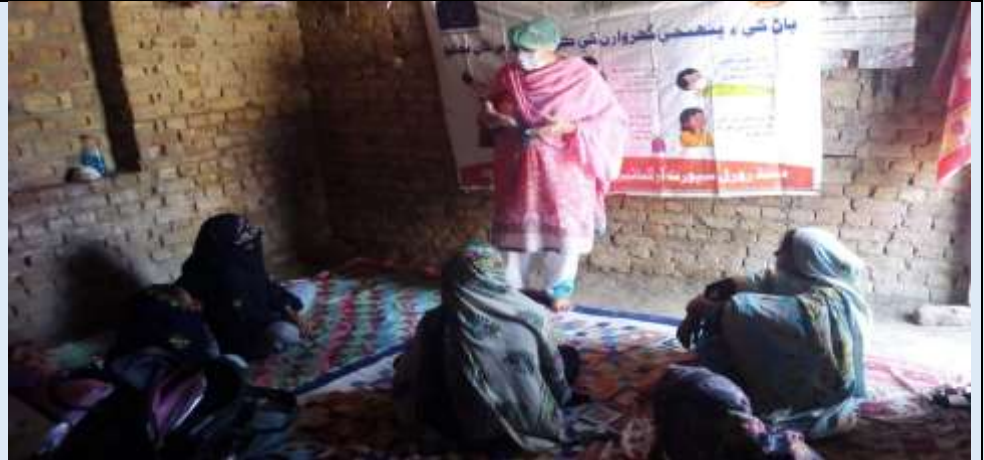
Community session on COVID-19 in District Shikarpur