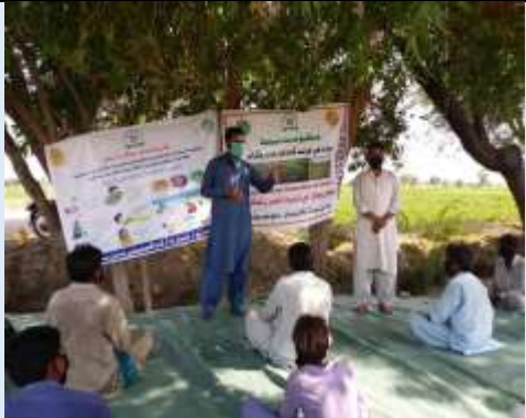
COVID-19 Sessions in Jacobabad