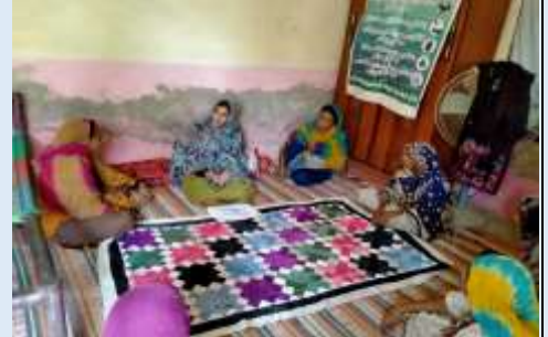
IEC Material distribution and Community Awareness Session on COVID-19 in District Jacobabad